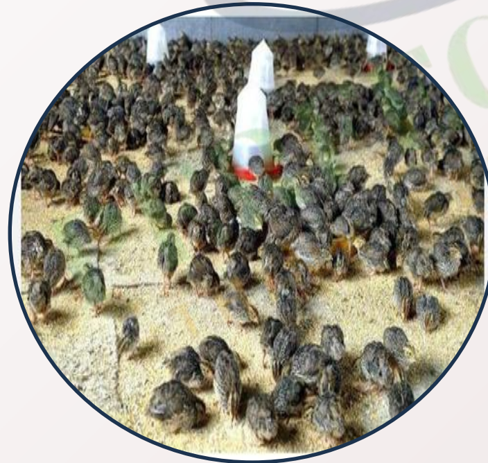
❖ Bater Farming