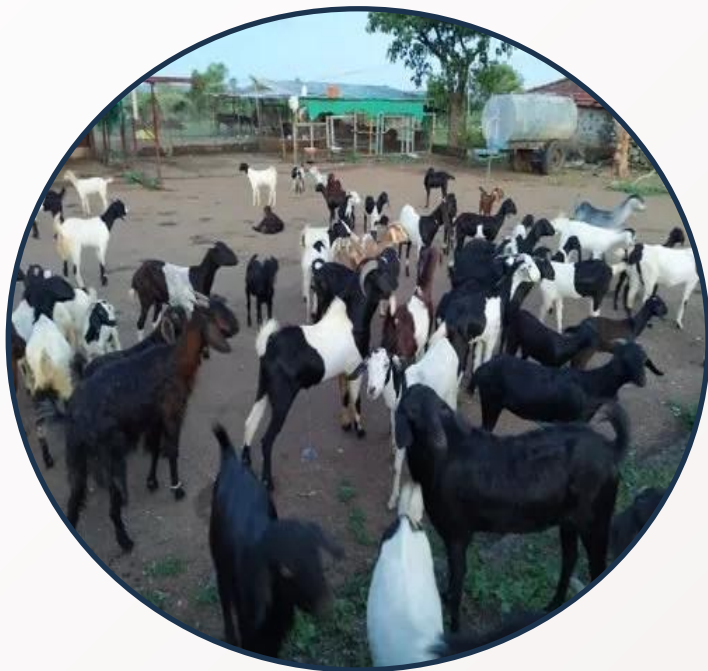
❖ Goat Farming