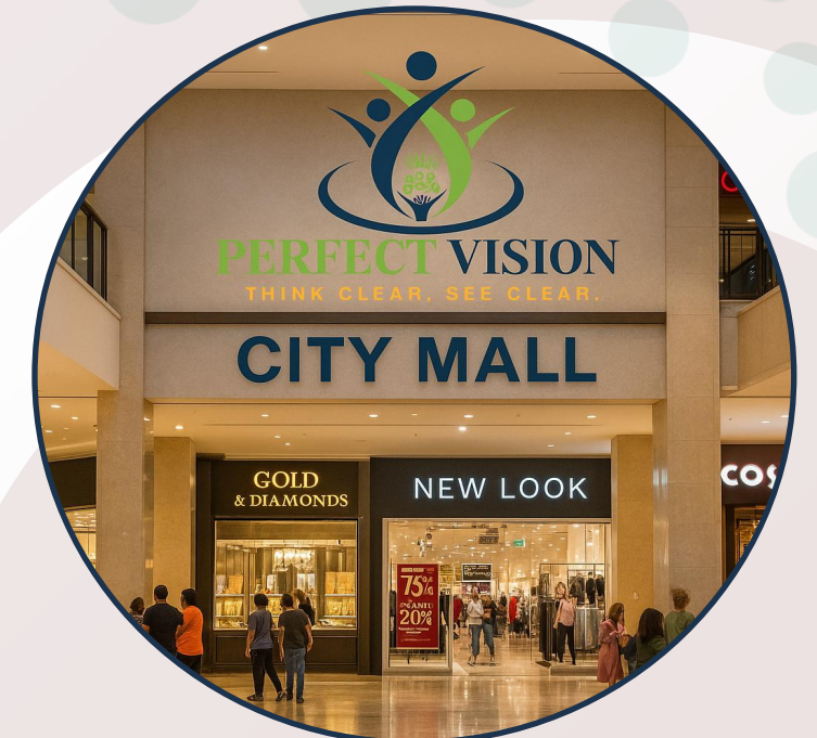
❖ CITY MALL