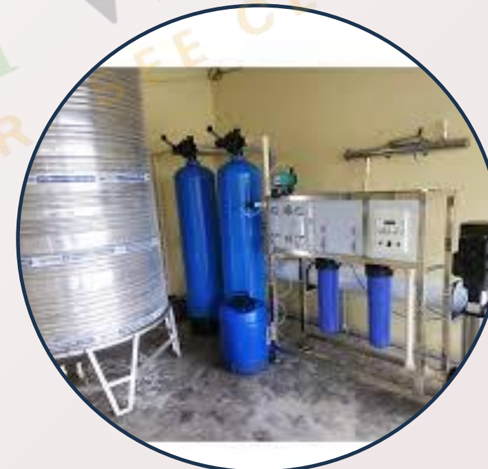
❖ RO Plant & Bottal Packing